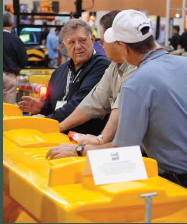
Exhibit your products and services at the most powerful and productive industry trade show in the world